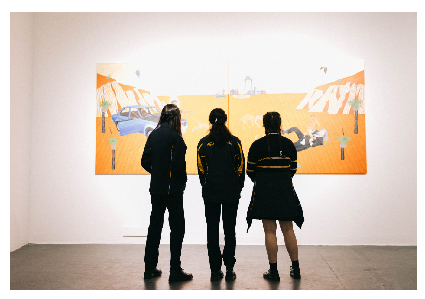
Education Workshop: Fresh Hell (2022), workshop documentation, Adelaide Contemporary Experimental.